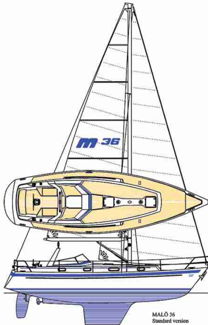
MALÖ 36 Standard version

In this transaction we are acting as Brokers only. We are informed that this sale is not related to the Owner's business, trade of profession. Whilst every care has been taken in their preparation, the correctness of these particulars is not guaranteed. The particulars are intended only as a guide and do not constitute a term of any contract. A prospective buyer is strongly advised to check the particulars and where appropriate to have the vessel fully surveyed and inspected, sea trialled and opened up.