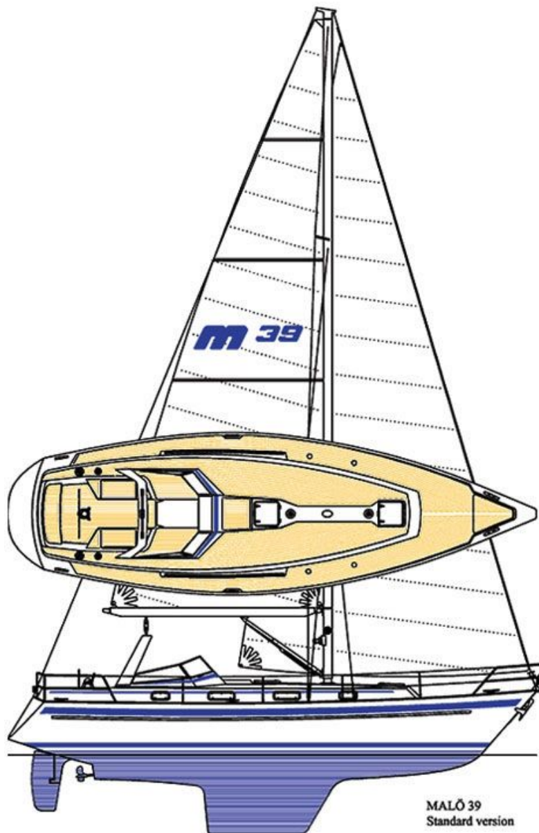
MALÖ 39 Standard version

In this transaction we are acting as Brokers only. We are informed that this sale is not related to the Owner's business, trade or profession. Whilst every care has been taken in their preparation, the correctness of these particulars is not guaranteed. The particulars are intended only as a guide and do not constitute a term of any contract. A prospective buyer is strongly advised to check the particulars and where appropriate to have the vessel fully surveyed and inspected, sea trialled and opened up.