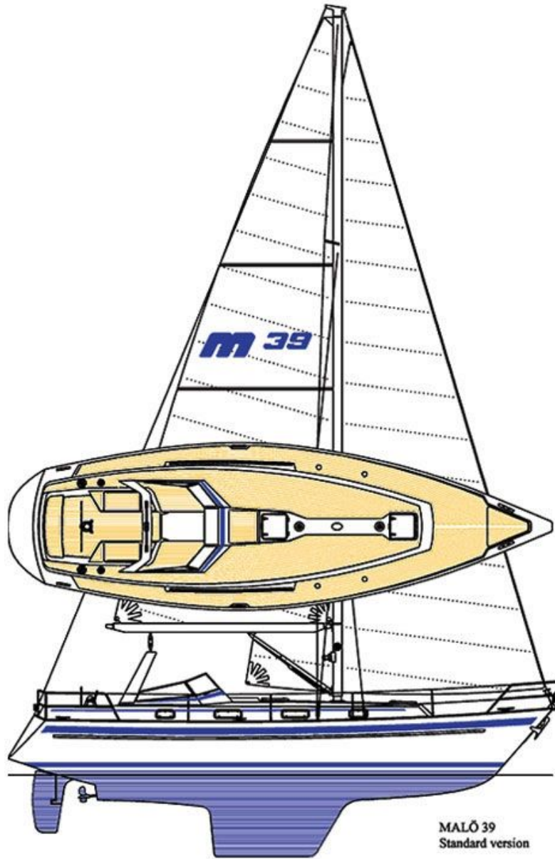
MALÖ 39 Standard version

In this transaction we are acting as Brokers only. We are informed that this sale is not related to the Owner's business, trade or profession. Whilst every care has been taken in their preparation, the correctness of these particulars is not guaranteed. The particulars are intended only as a guide and do not constitute a term of any contract. A prospective buyer is strongly advised to check the particulars and where appropriate to have the vessel fully surveyed and inspected, sea trialled and opened up.